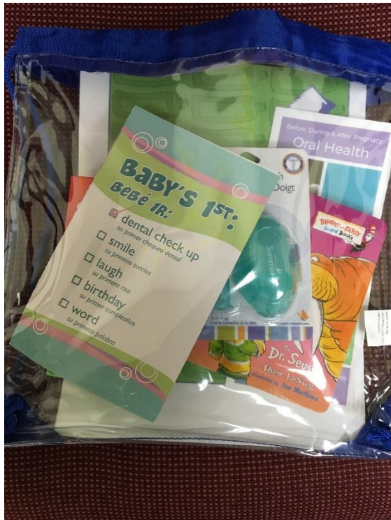
Children ages 0-3

Shanikque Blackwell blackwsl@dhec.sc.gov 864-227-5961 (office) 864-385-5664 (cell)